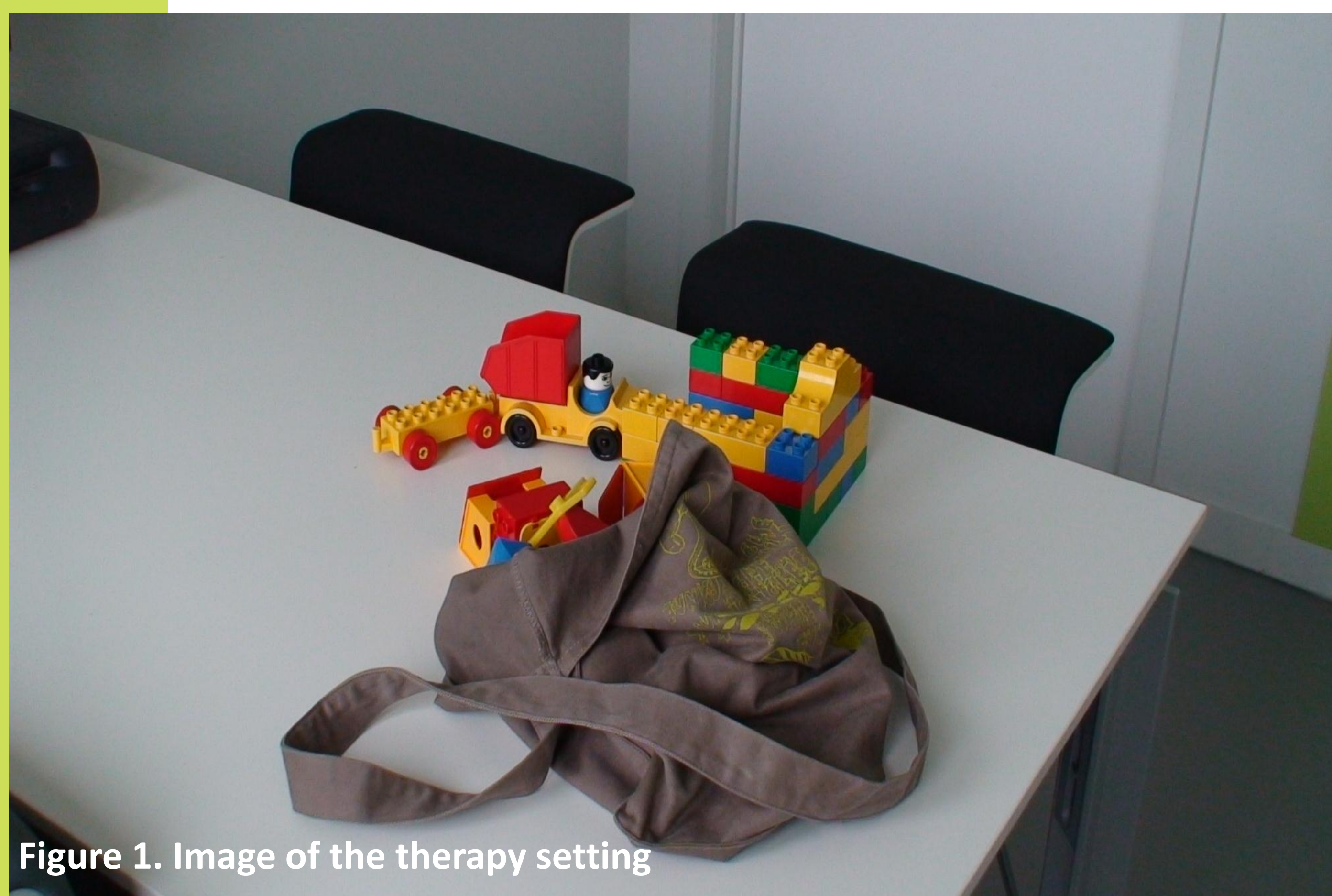
Figure 1. Image of the therapy setting

The aim of the present case study was to determine whether conditioning the speech activity was sufficient to decrease the stuttering characteristics in a very young boy diagnosed with early stuttering.